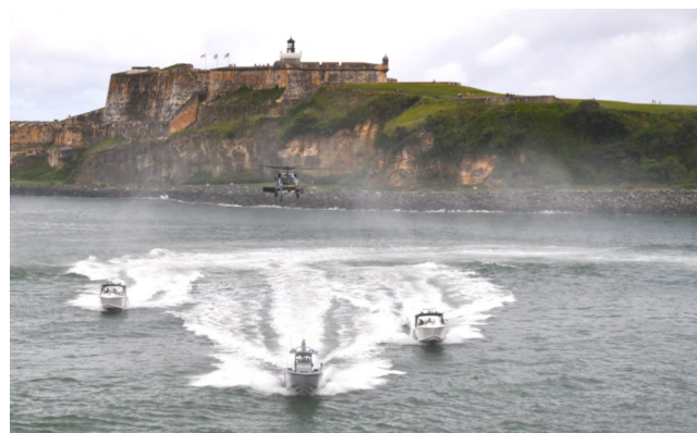
Office of Air and Marine vessels and UH-60 Black Hawk near San Juan Bay, Puerto Rico

For more information, visit the CBP.gov website or contact the Office of Public Affairs at (202) 344-1780.