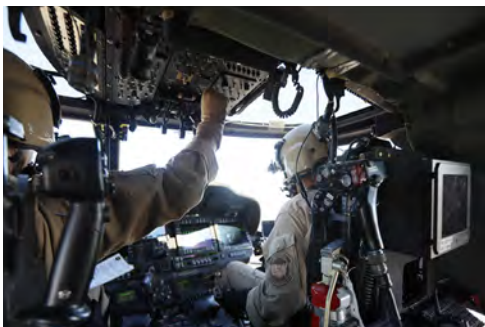
AIR AND MARINE OPERATIONS

2015: CBP’s Office of Air and Marine becomes Air and Marine Operations (AMO).