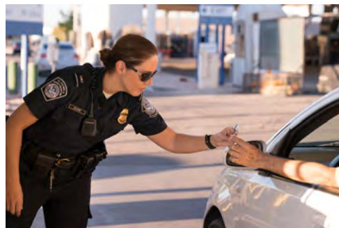
OFFICE OF FIELD OPERATIONS