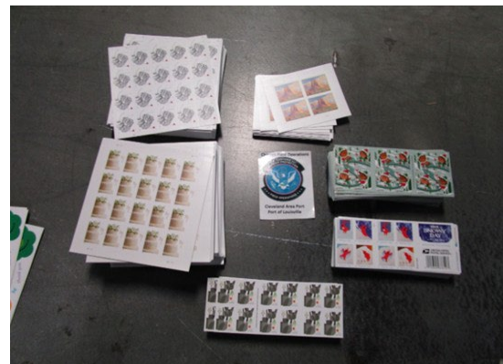
Counterfeit U.S. Postage stamps seized at Port of Louisville

U.S. Customs and Border Protection (CBP) and the U.S. Postal Service (USPS) work side by side at the International Mail Facilities across the U.S. to interdict illicit goods, which includes counterfeit stamps. Since 2021, CBP has intercepted and seized over 8.3 million counterfeit U.S. postage stamps with a manufacturer’s retail price (MSRP) of over $4.4 million.