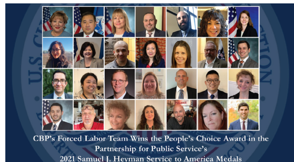
CBP's Forced Labor Team Wins the People's Choice Award in the Partnership for Public Service's 2021 Samuel J. Heyman Service to America Medals