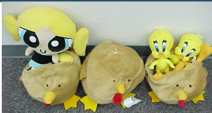
Counterfeit branded toys hidden inside generic merchandise for importation.

The extensiveness of unsafe, fake toys entering into the marketplace is evident in the past five years of seizure data. Notably, a peak in the estimated MSRP of seized counterfeit toys occurred in 2017 with a value of over $12 million. While the current data reflects a decrease in estimated MSRP, CBP continues to concentrate its efforts on fake toys as such merchandise harms the economy and poses a threat to the health and safety of American consumers.