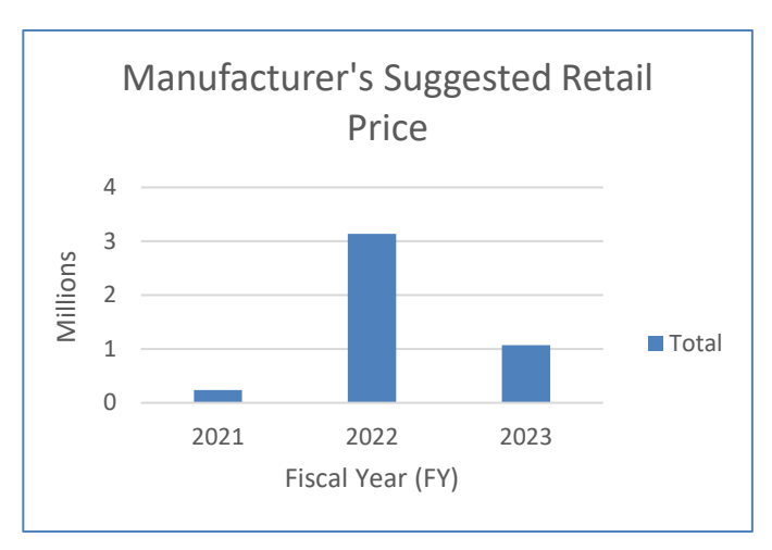
FY2023= October 2022 through March 2023

According to the United States Postal Inspection Service, the number of counterfeit stamps has escalated. Postage is considered counterfeit if it is any marking or indicia that is created without authorization from the Postal Service and is printed or applied on an item placed in the mail that indicates valid postage has been paid. U.S. consumers should be aware of the following: