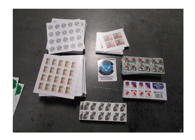
Counterfeit U.S. Postage stamps seized at Port of Louisville

U.S. Customs and Border Protection (CBP) and the U.S. Postal Service (USPS) work side by side at the International Mail Facilities across the U.S. to interdict illicit goods, which includes counterfeit stamps. Since 2021, CBP has intercepted and seized over 8.3 million counterfeit U.S. postage stamps with a manufacturer's retail price (MSRP) of over $4.4 million.