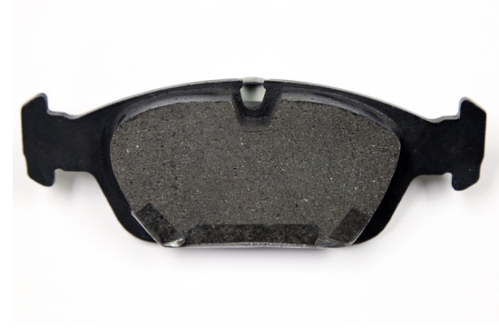
Brake pad seized at a port of entry.

Dependable automobile parts are essential to both personal and public safety. A close look at CBP statistics reflect a wide variety of automotive-related seizures. While