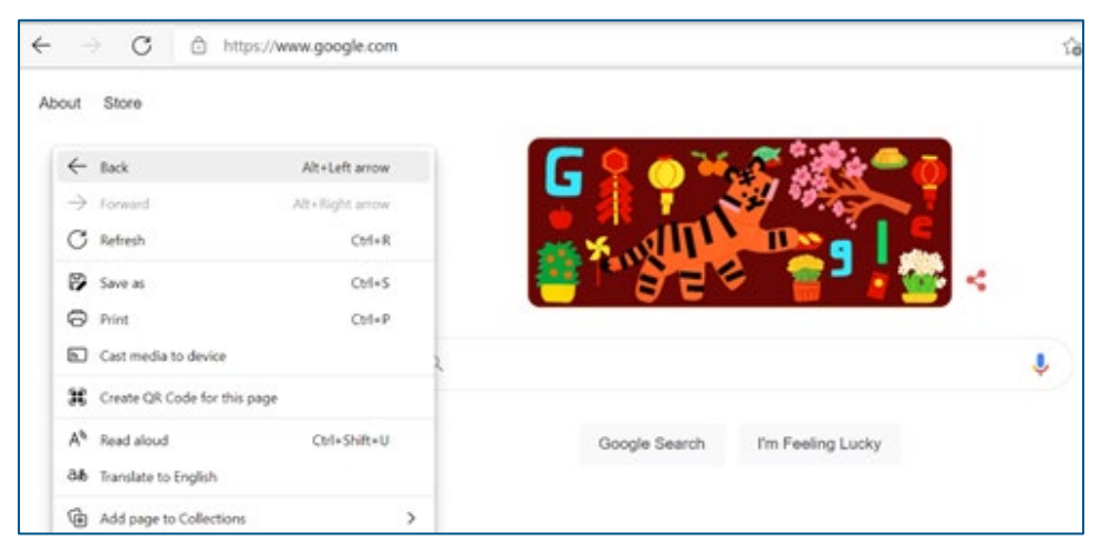
Page 1 of 4