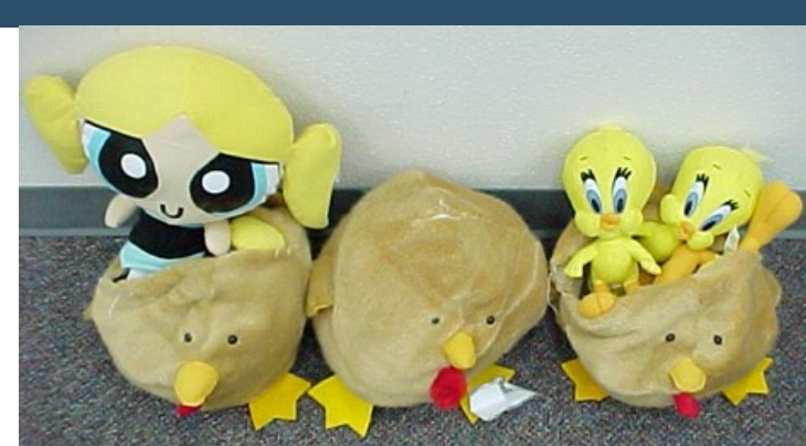
Counterfeit branded toys hidden inside generic merchandise for importation.

The extensiveness of unsafe, fake toys entering into the marketplace is evident in the past five years of seizure data. Notably, a peak in the estimated MSRP of seized counterfeit toys occurred in 2017 with a value of over $12 million. While the