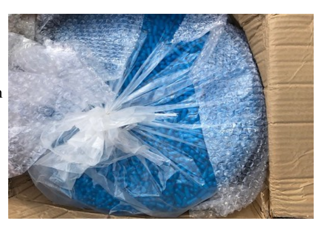
Unmarked blue pills seized at the port.

As consumers look for more convenient and affordable methods of acquiring medicines, many have turned to the internet. However, doing so comes with the risk of purchasing counterfeit pharmaceuticals.